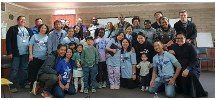
(Empowering & believing in Family Life, St Francis)