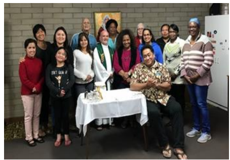
(Praising God' Charismatic retreat, St Francis)

The disciple of Christ is in continual need of revealed truth and life-giving grace. OLSH parishioners have a right and a duty to bring to maturity the seed of faith sown in them by God. This parish has been putting on many opportunities for adult formation such as retreats, Spirituality in the Pub, Social Justice Awareness activities, and Adult Formation workshops on Mondays by which we hope, you may consciously grow in the life of Christ through experience, reflection, prayer, and study. You don't have to attend everything, at least try your best to attend one retreat or formation per year. There is one final Parish Retreat coming up in November (date, theme and venue tba). Don't be tempted to think you're perfect!! Stay humble and keep learning